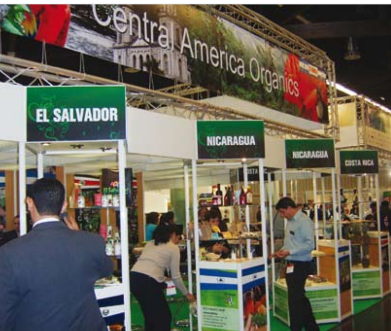
Stand from Central America at Biofach Fair, Nuremberg, Germany, February 2008. Ecomercados supported the participation of small enterprises and cooperatives from Nicaragua that want to find new buyers for their organic and fair trade products.

A recent set of guidelines points out yet another way for poor population groups to improve their income: by marketing so-called "neglected and under-utilised species". The advantage of such crops is that they usually have highly specific uses based on traditional knowl-