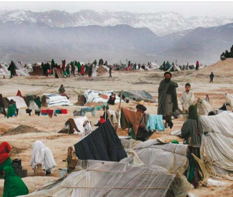
In the south of Afghanistan people have fled mainly due to drought and less due to conflicts. Information: International Organization for Migration.