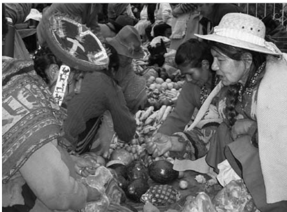
Local market in Lares, Province of Cuzco, Peru.

Towards food sovereignty: reclaiming autonomous food systems. Michel Pimbert. IIED. 2008. 58 p. www.iied.org/pubs/pdfs/G02268.pdf