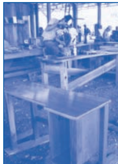
Unit to process residual timber from export into furniture and parquet flooring. Community forest of the Maya reserve, El Petén, Guatemala. Photo: Jürgen Blaser, 2006.

InfoResources Focus is published three times a year in English, French and Spanish. It is available free of charge and may be ordered in pdf format, or as a print publication from the address below.