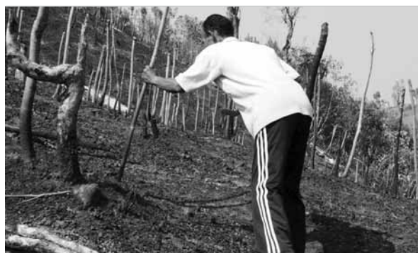
A farmer in Nepal conserves the soil of his land by practicing a local method of minimum tillage.