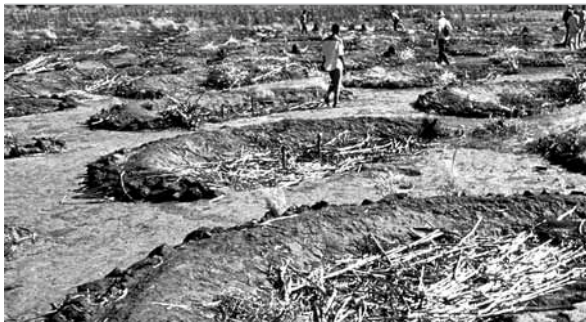
Half moons on a compact surface area, Niger. Mulching increases infiltration and soil biology, and reduces evaporation.