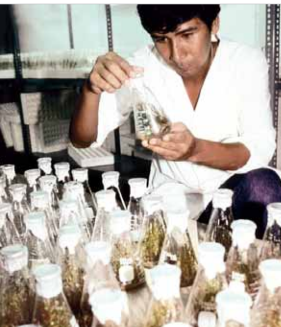
The local population should benefit from the results of research on its plant genetic resources. Technician observes cultures in tissue culture laboratory of the International Potato Centre, Lima, Peru.

This is a first step towards eliminating the imbalance between poor rural populations in developing countries with abundant resources, on the one hand, and business corporations from wealthy industrial nations that derive profit from these resources, on the other hand. A book entitled Rights to Plant Genetic Resources and Traditional Knowledge argues that various further steps are needed. Among other things, the authors recommend that international law be developed so as to generally improve the protection of developing countries against abusive exploitation of their plant genetic resources. The authors also suggest the introduction of so-called Traditional Intellectual Property Rights to protect population groups' traditional knowledge about the use of genetic resources – an issue not covered by existing intellectual property rights. The pro-