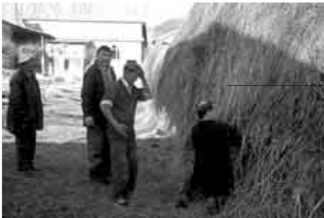
A farmer is surprised that the monitoring team assesses the quality of his hay so cautiously. Issyk Kul province, Kyrgyzstan.

www.helvetas.ch/global/pdf/english/Professional_competences/Documented_experiences/Civil_Society_and_the_State/You_pay_for_what_you_get_Publ_4.pdf