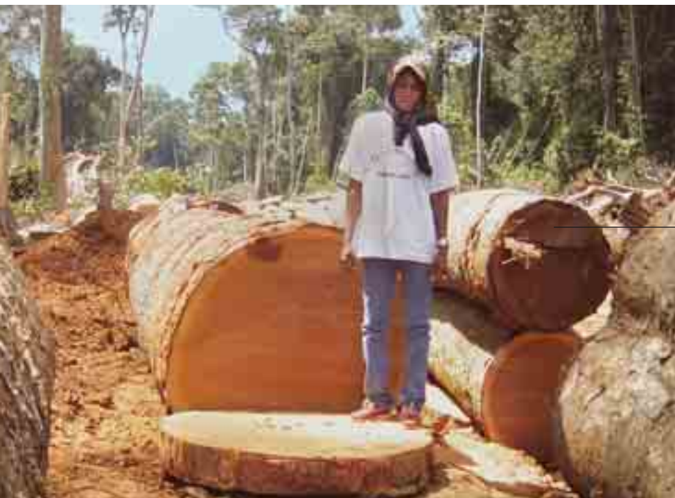
Biotechnology can be used for the selection of forest species based on targeted ecological and economical characteristics (in the case of sapelli on the picture) as well as based on conservation criteria related to the genetic variability of a given species.

Forestry programmes could use the vegetative multiplication of forest species to increase the given genetic material and to stock it appropriately. Somewhat paradoxically, it could also help to ensure the availability of a substantial base of