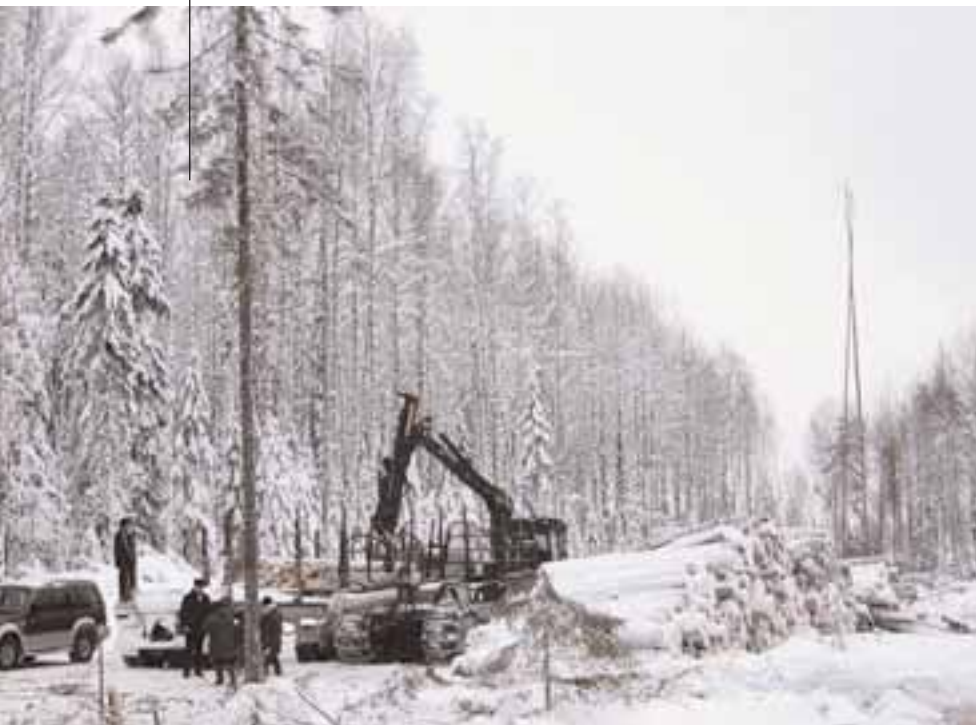
Certified forest operation in Objachevo, Komi Republic.

The Russian case reflects various aspects of sustainable forest management in practice. The certification project Priluzye Model Forest (PMF) , which covers 795,000 ha in the Komi Republic in northeast Russia, was launched in 1996 by the WWF. In 2002, the NGO Silver Taiga took over the reins with financial support from the Swiss Agency for Development and Cooperation (SDC). One interesting part of this project was the development of a mapping system for high conservation value