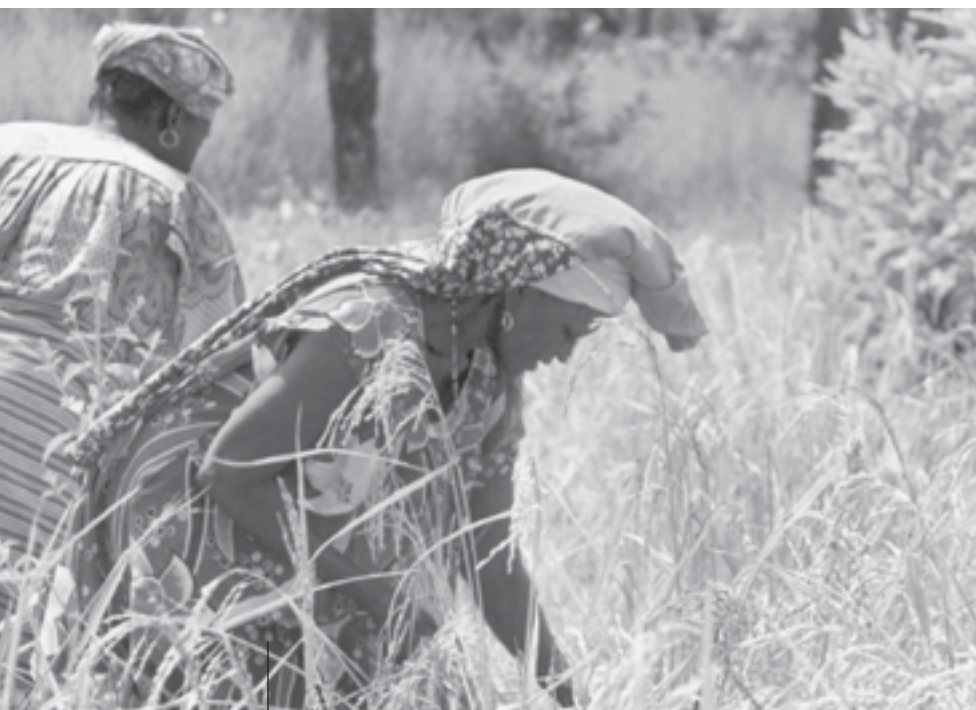
Farmers assessing Participatory Varietal Selection (PVS) trials, forest zone, The Gambia.

New Rice for Africa: NERICA – Rice for Life. West Africa Rice Development Association (WARDA), 2001. 8 p. www.warda.org/publications/NERICA8.pdf