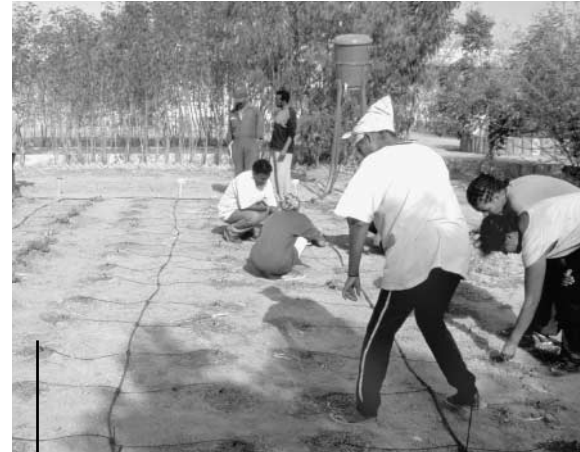
Students at the agricultural school in Hagaz, Eritrea, test the new technology.

The study cited here, done in Eritrea, identifies home gardens in peri-urban areas as a particularly suitable context for introducing small-scale micro irrigation. Women are an especially important target group, as they usually tend the gardens and are not allowed to plough fields – a task that is not required with use of this technology.