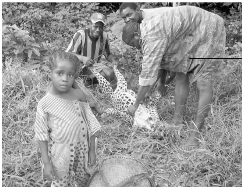
Family preparing leopard stricken by a car in Northern Congo. The meat will be eaten by the family, the fur will have to be given to the Authorities. Photo: J. Blaser, 2002, Pokola, Congo

Given the threat of extinction of some of the large and more "charismatic" animal species such as elephants and gorillas, conservationists often condemn the damage done by hunting (especially opening up roads and forest camps in previously "untouched" areas).